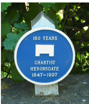
Plaque by drive of Wood Way

3.11 Between Woodway and Woodene (Grade II) are two newer properties, Wood Way (Grade II) and Fairfield, both again unobtrusive. Opposite Fairfield is a stable block, single storey and of open courtyard plan. In the grounds of Long Meadow (Grade II) is Stanmore Lodge a more substantial property and opposite is Sunnyside one of the original Chartist cottages and, again, a Listed Building. This stretch of the road retains much of the rural character of the original settlement.