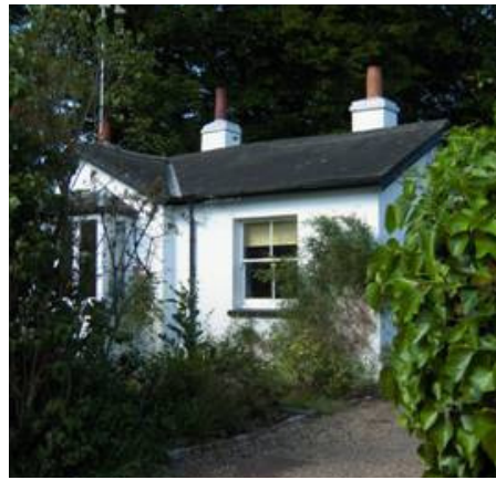
Sunnyside, Nottingham Road.