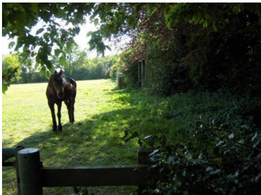
Paddock adjacent to Stanmore Lodge