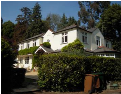
Hope Cottage (known locally as Hope Lodge)