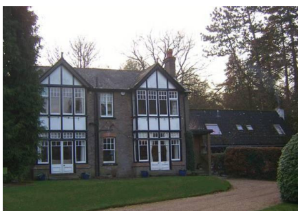
Heron's Lodge and Cherry Cottage