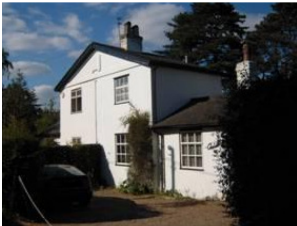
Laurel Cottage and Crowthorne, Nottingham Road.