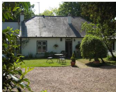
Cherry Tree Corner