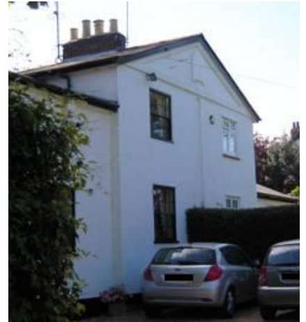
Long Meadow and Woodene, Nottingham Road.