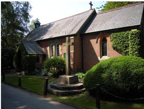
St John's Church