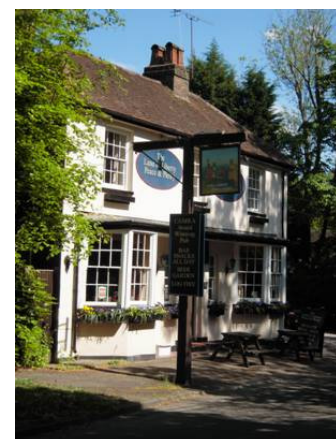
Land of Liberty Peace & Plenty