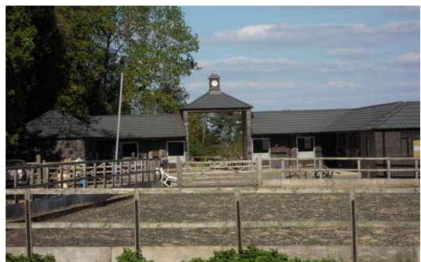
Stable Block opposite Fairfield