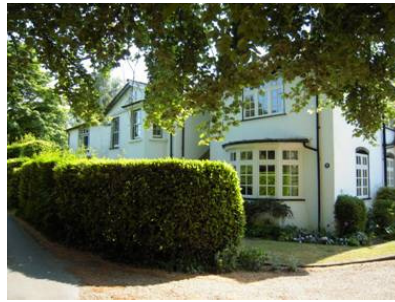
The Hop Garden and Laburnums,