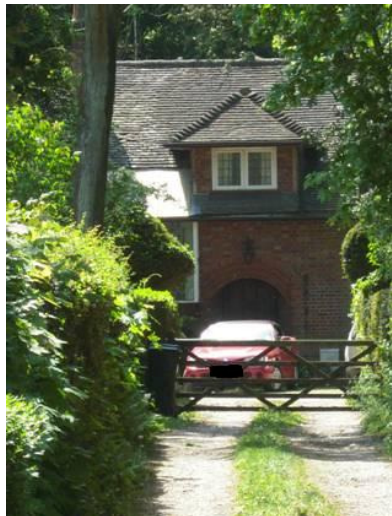
Long Lane House