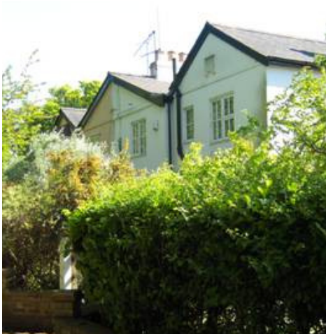
Wood Way and Chartist Cottage, Nottingham Road.

Several of the original Chartist houses are relatively unchanged and nine are Grade II Listed Buildings. All of these are noted as being of 1846-47 for Chartist Co-operative Land Company, having rectangular panels with sides extended downwards, a sign that was used throughout O'Connorville. They are amongst the best surviving examples of the houses founded by the Chartist Leader, Feargus O'Connor.