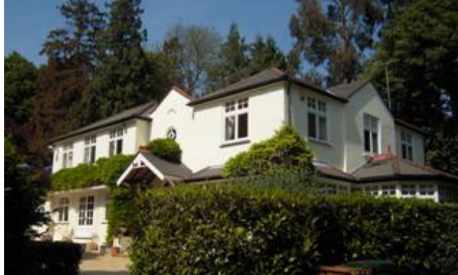
Hope Cottage (known locally as Hope Lodge)

3.22 At the pedestrian gate, Nottingham Road turns through 90° and becomes Bradford Road. Apart from the view of the modern Glenthorne on the left, there are just three houses on the higher ground to the right. The Limes is a brick building with an arched entrance and 1 st floor balcony while Hope Cottage (known locally as Hope Lodge) is a much altered Chartist house. The last house, Endlands, was rebuilt about 30 years ago and is a two storey brick house with a tiled 1 st floor and roof.