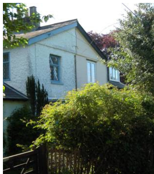
Craven Cottage and Rosemary, Nottingham Road.