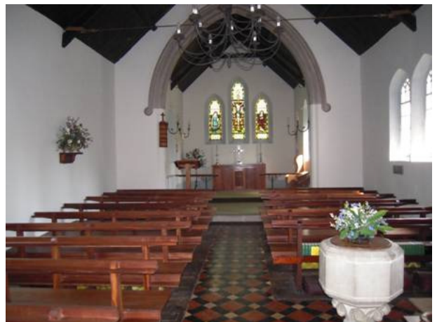
Interior of St John's Church