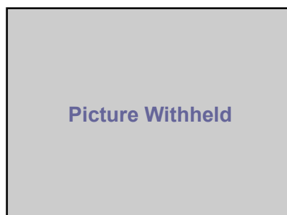
The Bower House