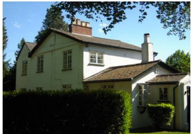
Bircham and Little Whaddon, Nottingham Road. (Now one house)