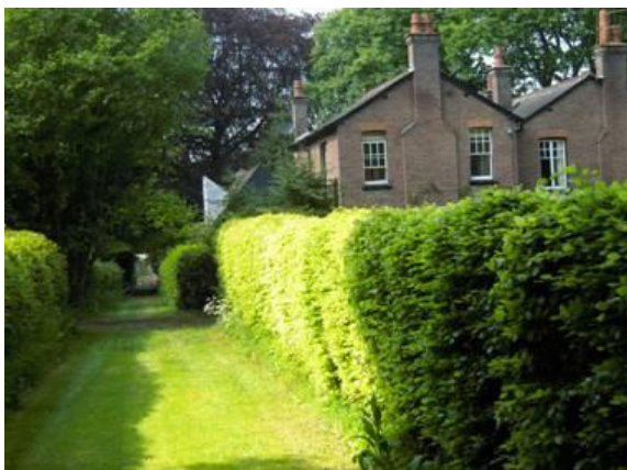
Group of buildings around Herons Lodge

3.26 From here, Halifax Road rises gently to the north-west with original Chartist houses and cottages on the right. First there is the group around Herons Lodge opposite which is the meadow and footpath back to Nottingham Road. The main house and outbuildings form a distinctive group and, along with the adjoining Sherwood, are described later in this appraisal. There is another plaque at the entrance to Sherwood.