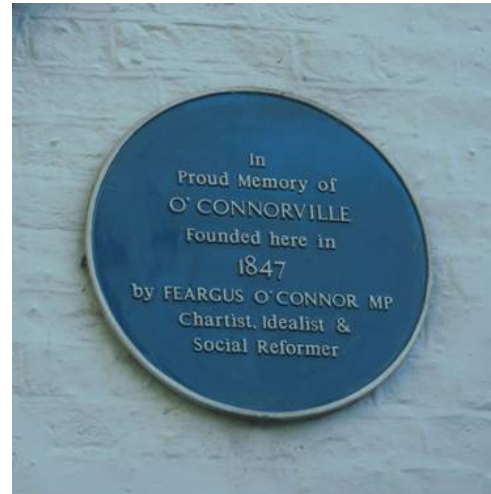
Plaque on Heronsgate Hall