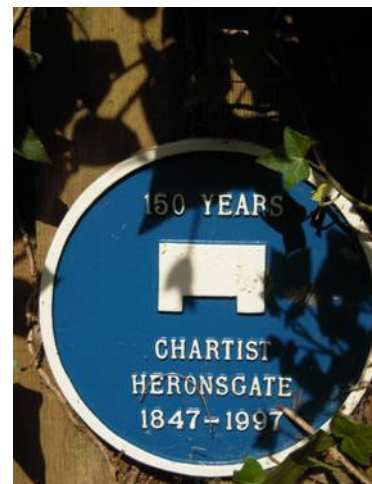
Plaque at entrance to Sherwood